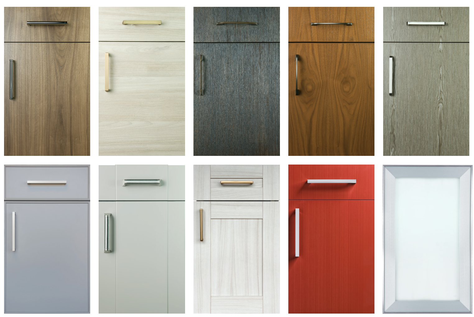
(L-R) 1. Contempo Full Overlay | Walnut Natural 2. Milano Full Overlay | Mystic Cove Horizontal Grain 3. Ridge Full Overlay | Maple Tamarind 4. Apollo Full Overlay | Walnut Heirloom 5. Radison Full Overlay | Mojave 6. Vesta Full Overlay | Maple Stone 7. Acela Full Overlay | Maple Khaki 8. Strata Full Overlay | Silver Sand 9. Level Full Overlay | Wired Copper 10. Element Full Overlay | Natural Aluminum

European design ideas and materials have a strong influence on American contemporary style. Clean, flat paneled doors enhanced with integrated pulls, or a completely hardware free look are tenets of this style. Smooth panels mixed with textured or colored panels add interest and warmth.