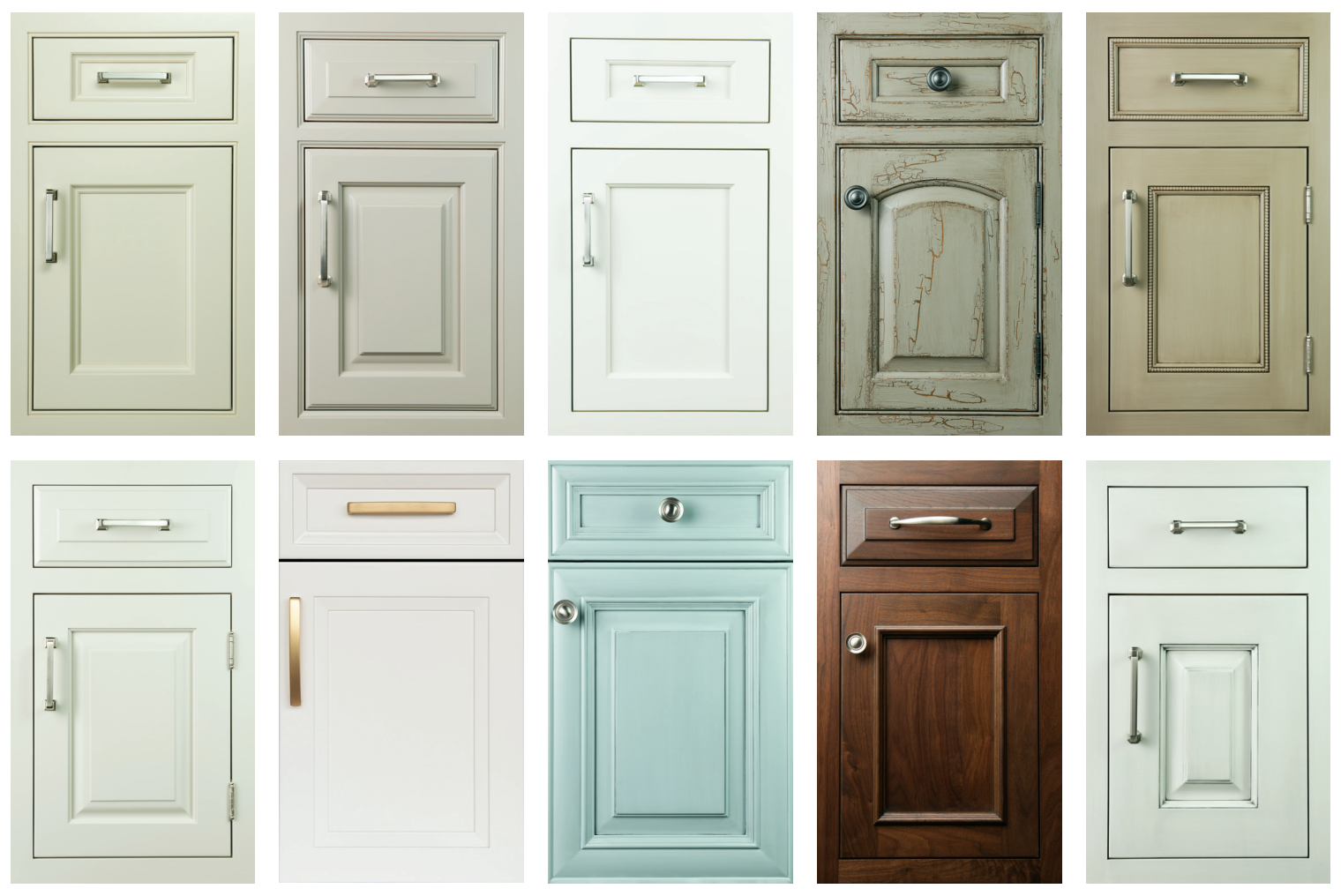
(L-R) 1. 1" thick Statesman Beaded Inset | Maple Fawn 2. 1" thick Vintage Ogee Inset | Maple Khaki 3. Vogue Flush Inset | Maple White Sand 4. Singleton Beaded Inset | Maple Pebble Brushmark Crackle 5. Tapestry Flush Inset | Maple Harvest Shadow 6. Vintage Flush Inset | Maple Slate White 7. Mirage Full Overlay | Five Piece MDF Cascasde White 8. Madrid Full Overlay | Maple Mystic Blue 9. Kent Flush Inset | Walnut Cocoa 10. 1" thick Provence Flush Inset | Maple Waterloo

Timeless, formal lines and amenities deliver a classic style known as traditional. This style follows the architecture of the home and creates comfort from a formal setting. It is warm, elegant, and inviting. Traditional design also features fine details, elaborate mouldings, custom built corbels, hand fitted doors and drawers as well as hand glazed finishes.