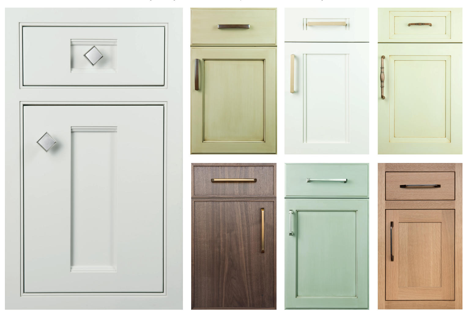
(L-R) 1. Skyline Beaded Inset | Maple Slate White 2. Vogue Full Overlay | Maple Cottage 3. 1" thick Catalina Full Overlay | Maple White Sand 4. Mirage Full Overlay | Maple Linen 5. Millbrook Full Overlay | Walnut Natural 6. Vogue Full Overlay | Maple Mystic Green 7. Quaker Flush Inset | Rift Cut White Oak Natural

Transitional style is a marriage of traditional and contemporary styles, finishes, materials, and hardware. The cabinet lines are simple yet sophisticated, featuring either straight lines or soft rounded profiles. This clean, streamlined look feels like home in the middle of a busy lifestyle. It features flat panel doors, full overlay cabinets, and sleek hardware.