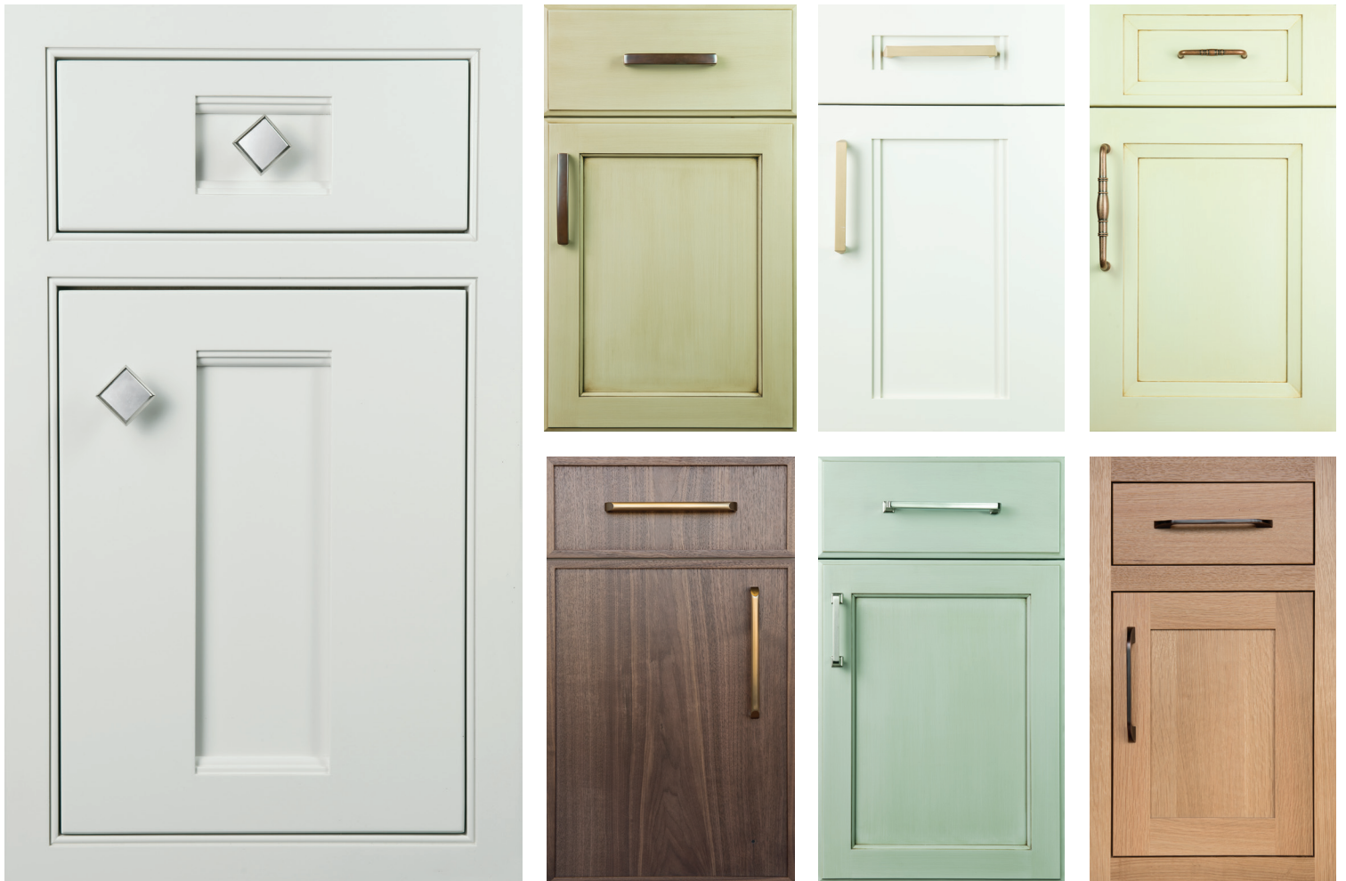
(L-R) 1. Skyline Beaded Inset | Maple Slate White 2. Vogue Full Overlay | Maple Cottage 3. 1" thick Catalina Full Overlay | Maple White Sand 4. Mirage Full Overlay | Maple Linen 5. Millbrook Full Overlay | Walnut Natural 6. Vogue Full Overlay | Maple Mystic Green 7. Quaker Flush Inset | Rift Cut White Oak Natural

Transitional style is a marriage of traditional and contemporary styles, finishes, materials, and hardware. The cabinet lines are simple yet sophisticated, featuring either straight lines or soft rounded profiles. This clean, streamlined look feels like home in the middle of a busy lifestyle. It features flat panel doors, full overlay cabinets, and sleek hardware.