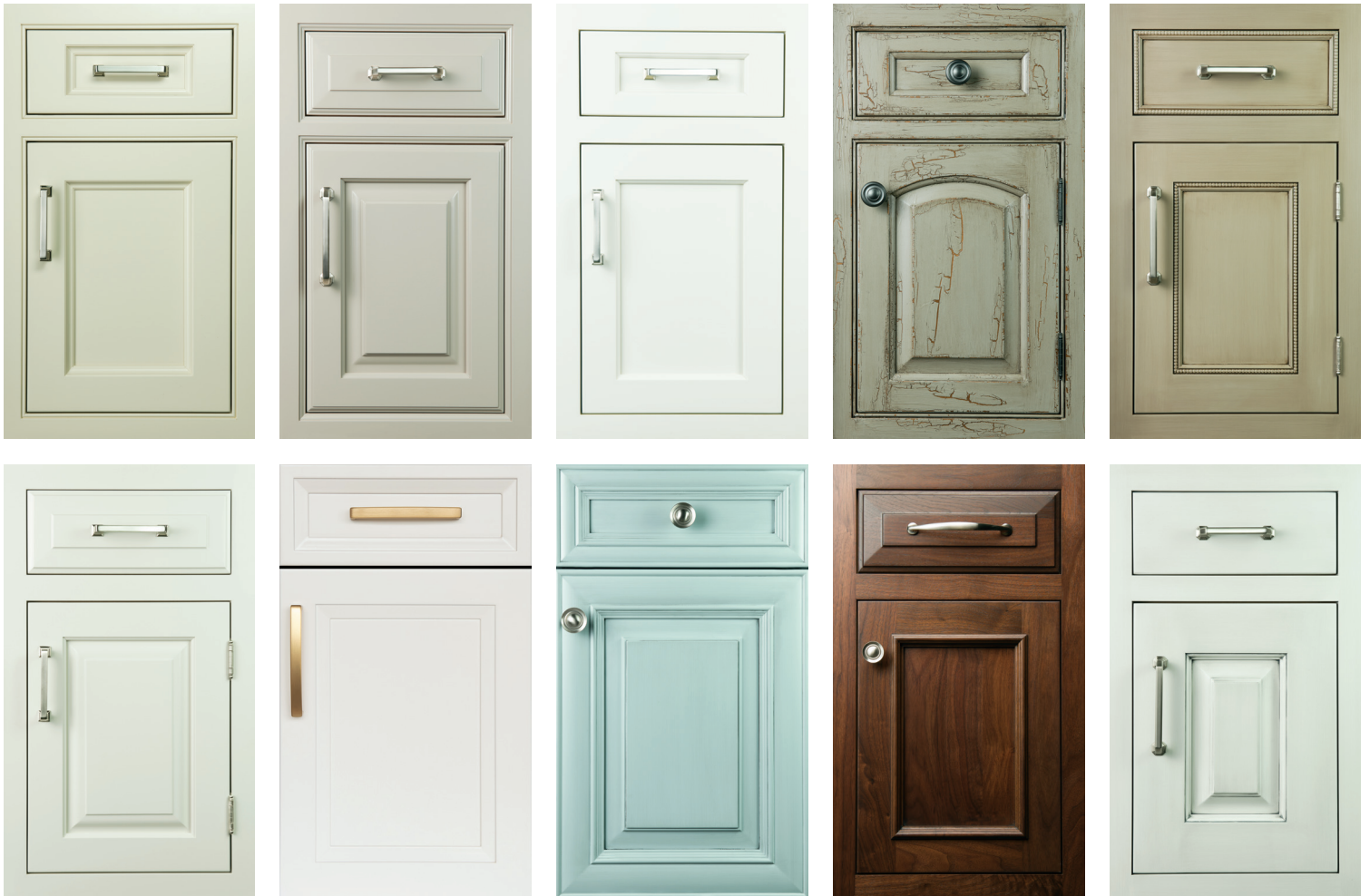
(L-R) 1. 1" thick Statesman Beaded Inset | Maple Fawn 2. 1" thick Vintage Ogee Inset | Maple Khaki 3. Vogue Flush Inset | Maple White Sand 4. Singleton Beaded Inset | Maple Pebble Brushmark Crackle 5. Tapestry Flush Inset | Maple Harvest Shadow 6. Vintage Flush Inset | Maple Slate White 7. Mirage Full Overlay | Five Piece MDF Cascade White 8. Madrid Full Overlay | Maple Mystic Blue 9. Kent Flush Inset | Walnut Cocoa 10. 1" thick Provence Flush Inset | Maple Waterloo

Timeless, formal lines and amenities deliver a classic style known as traditional. This style follows the architecture of the home and creates comfort from a formal setting. It is warm, elegant, and inviting. Traditional design also features fine details, elaborate mouldings, custom built corbels, hand fitted doors and drawers as well as hand glazed finishes.