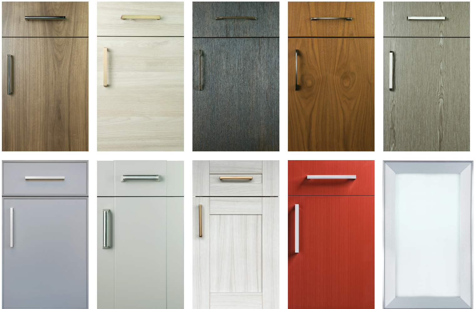
(L-R) 1. Contempo Full Overlay | Walnut Natural 2. Milano Full Overlay | Mystic Cove Horizontal Grain 3. Ridge Full Overlay | Maple Tamarind 4. Apollo Full Overlay | Walnut Heirloom 5. Radison Full Overlay | Mojave 6. Vesta Full Overlay | Maple Stone 7. Acela Full Overlay | Maple Khaki 8. Strata Full Overlay | Silver Sand 9. Level Full Overlay | Wired Copper 10. Element Full Overlay | Natural Aluminum

European design ideas and materials have a strong influence on American contemporary style. Clean, flat paneled doors enhanced with integrated pulls, or a completely hardware free look are tenets of this style. Smooth panels mixed with textured or colored panels add interest and warmth.